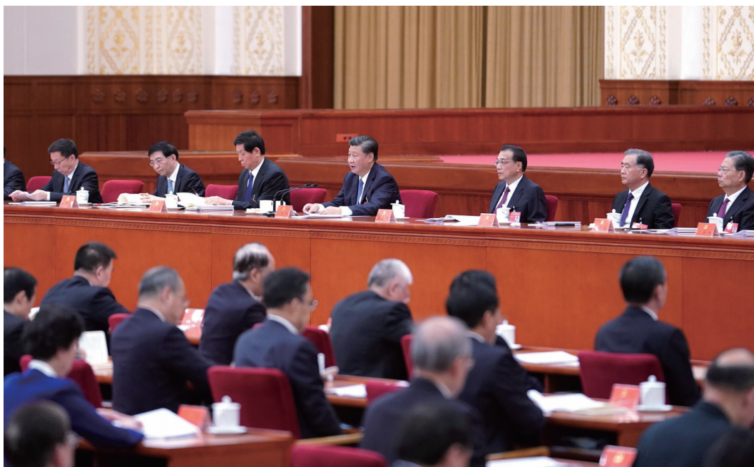
Figure 3. The Fifth Plenum of the 19 th Central Committee of the Communist Party of China

Source: 〈第一觀察 讀懂五中全會，這是一個導航密碼〉, Xinhuanet , November 10, 2020, < http://big5.xinhuanet.com/gate/big5/www.xinhuanet.com/politics/leaders/2020-11/10/c_1126718542.htm >.