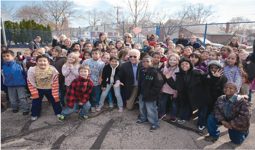
Figure 7. Joe Biden with Children Supporters

On July 27, 2020, according to “2020 Democratic Party Platform,” which emphasized that the U.S., as a Pacific power “should work closely with its allies and partners to advance our shared prosperity, security, and values—and shape the unfolding Pacific Century.” 23 Regarding the China issue, Biden said his approach will “focus on boosting American competitiveness, revitalizing our strengths at home, and renewing our alliances and leadership abroad.” 24 In other words, Biden said the U.S. would work to cooperate with China when it is in the U.S. national interest, such as on public health and climate change.