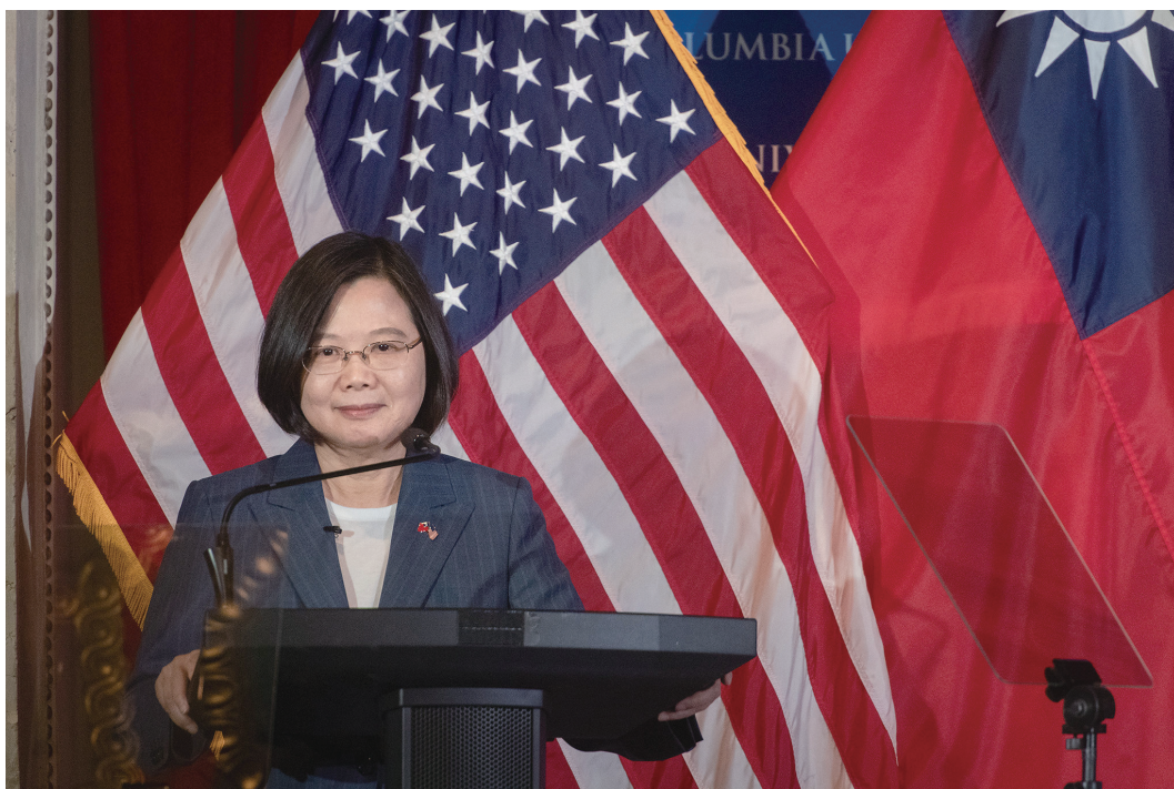
Figure 9. President Tsai Attends Discussion Session at Columbia University

Source: Office of the President, Taiwan (R.O.C.), “President Tsai attends discussion session at Columbia University,” July 13, 2019, Office of the President, Taiwan (R.O.C.) , < https://english.president.gov.tw/NEWS/5776 >.