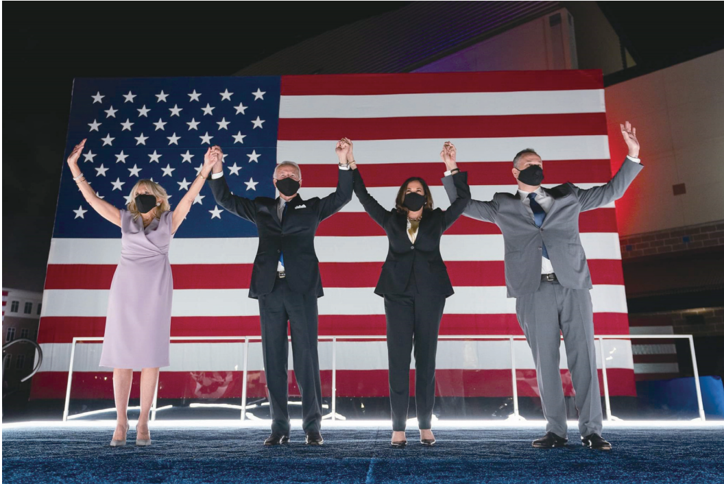
Figure 1. Joe Biden and Kamala Harris Won the U.S. Presidential Election