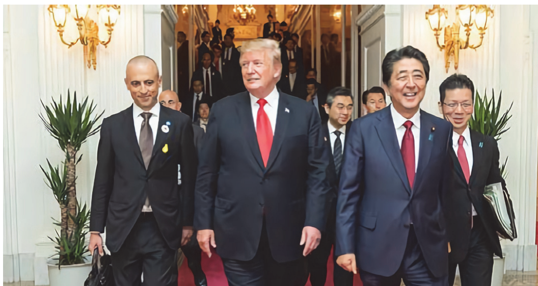
Figure 6. President Trump and Prime Minister Shinzo Abe, Following Their Meetings on Indo-Pacific Cooperation, May 27, 2019