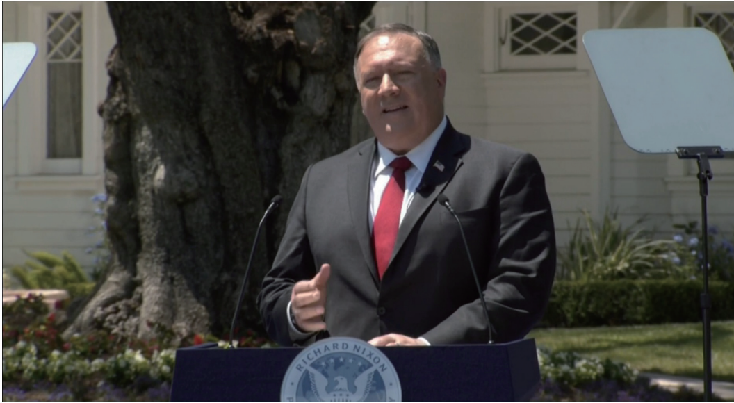
Figure 4. Secretary Michael R. Pompeo Delivers a Speech on China Policy

Source: Michael R. Pompeo, “Communist China and the Free World’s Future.”