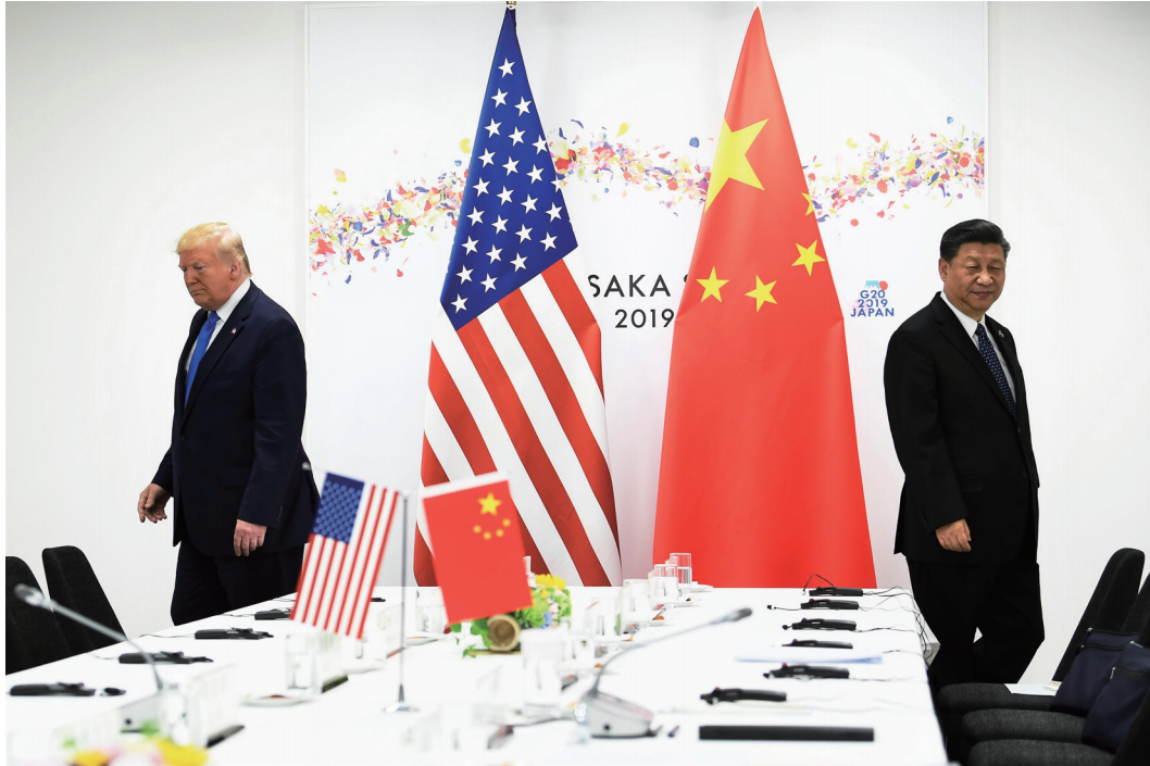
Figure 8. Donald Trump and Xi Jinping at 2019 G20 Summit