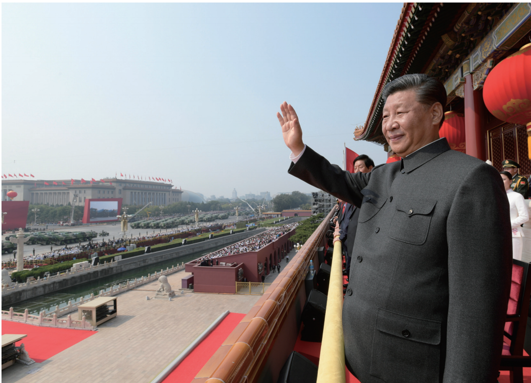
Figure 2. Celebrating the 70 th Anniversary of the People's Republic of China, Xi Jinping Reviews the Troops

First of all, China's rise brought its national comprehensive power and increased its international status, especially when Xi Jinping took power as General Secretary of Chinese Communist Party, CCP, in 2012 and began his grand strategy regarding "Chinese Dream" and "To realize the Chinese dream of great Chinese nation rejuvenation."