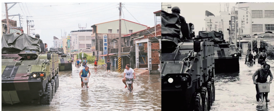
Figure 5. Cropped Photo of President Tsai Visiting Flood Victims

Websites, social media and chat applications such as LINE have been used to disseminate disinformation about President Tsai and her administration. There was also confirmation that the information originated from China, according to a report in the Liberty Times . 15 China's state-run media, such as Global Times and China Review News , serve as platforms to exacerbate and respond to disinformation, as well as government-linked Weibo accounts. The People's Liberation Army-linked 311 Base on psychological warfare and 61716 Unit in Fujian Province also have control of media outlets. The Tsai administration's response to last summer's flooding in southern Taiwan was one of the prime examples of disinformation.