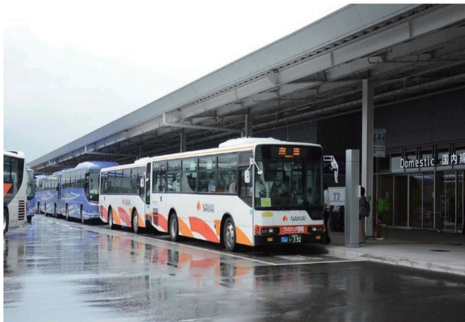
Figure 6. Why is There so Much Fake News about “Preferential Treatment of Chinese People”?

Source: 劉彥甫, 〈「中国人優遇」の偽ニュースはなぜ生まれたか 関空の中国人避難問題, 一連の事実を検証〉, TOYOKEIZAI , September 21, 2018, < https://toyokeizai.net/articles/-/238795 >.