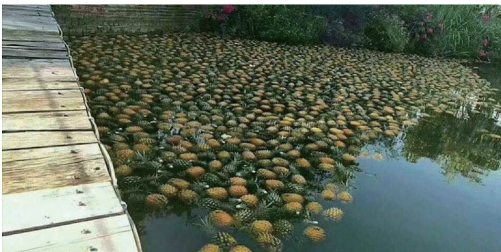
Figure 7. Photo of Pineapple Taken in China Instead of Taiwan

the target. A pomelo farmer from Tainan made an allegation on Taiwan's local channel, CTiTV , that he had to dump 1.2 million kilograms of pomelo into the Zengwen Reservoir. Later, the allegation was proven to be untrue, as the Zengwen Reservoir is unable to accommodate the number of pomelo alleged by the farmer. The farmer later apologized, claiming that he had "misspoken" on the news. CTiTV is a news channel affiliated with the Want Want China Times Group. Its owner, Tsai Eng-meng, was the target of the Anti-Media Monopoly Movement in 2012, when university students and civil society protested against his purchasing Taiwan's cable network and inserting advertorials in the China Times newspaper to promote China's political agenda.