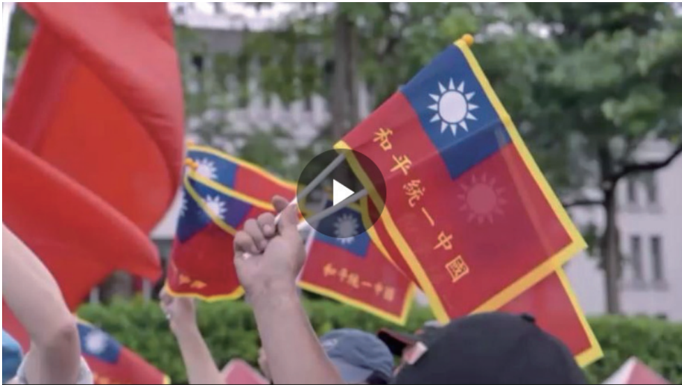
Figure 3. Al Jazeera Investigative Report on China's Local Proxies in Taiwan

police confiscated NT$9.73 billion from individuals suspected of taking illegal bets. 11 In addition, according to the United Daily News , similar to Mirror Media's report, the Kaohsiung Mayoral election attracted the highest sums and largest numbers of bets of all the local elections in 2018, especially when KMT candidate Han Guo-yu began to obtain increasing support in the polls. 12 By inserting funds into the gambling black market of, the Chinese government is able to shape the local rhetoric as to which candidate the citizens favor and further influence voting decision of local voters.