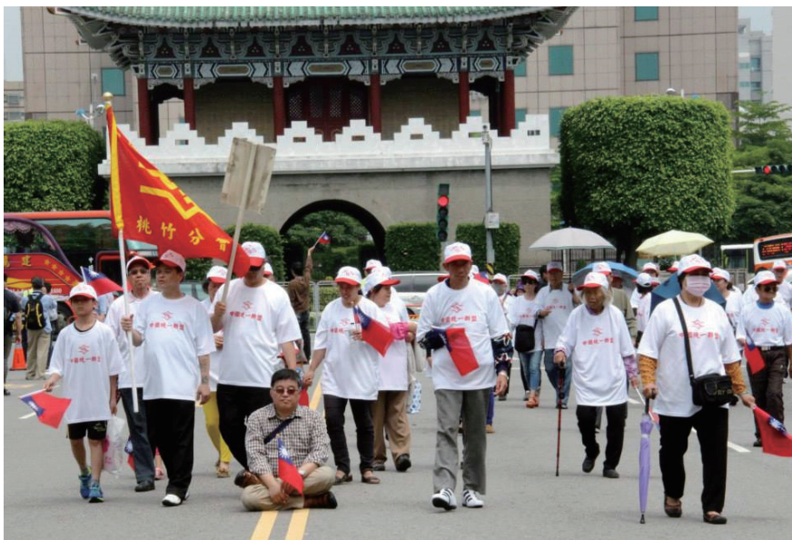
Figure 4. Chinese Unification Alliance at the New May Fourth Movement.

The CUPP made their presence known during the Sunflower Movement in 2014. In a rally called the “New May Fourth Movement,” members of CUPP gathered on Ketagalan Boulevard, according to the Party, to demonstrate their support for law enforcement officers and to protest the illegal occupation of the Legislative Yuan, but to also advocate their political aim of unifying Taiwan with China.