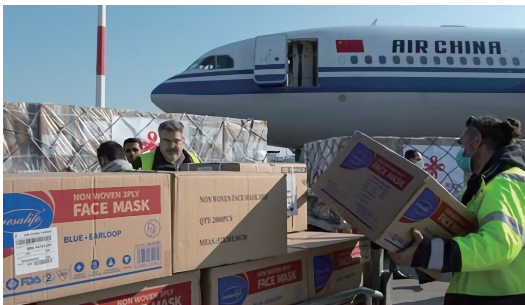
Figure 6. Airport Staff Unload Boxes of Face Masks and Medical Supplies from an Airplane of Air China, in Athens, Greece, on March 21, 2020

inated in the United States, the Chinese leadership also is releasing a huge amount of news focusing on China's coronavirus foreign aid. This is to demonstrate to Chinese people that, while the rest of the world is under siege by the coronavirus, the Chinese government is more capable and acts more efficiently than the Western democratic governments, which also bolsters Xi Jinping's longstanding emphasis on his reform policies. China's propaganda is accepted very easily as most countries are ill-equipped to face the COVID-19 pandemic. Through donating medical protective supplies, deploying medical teams, and providing or promising to supply humanitarian aid to the world, China has manifested to its people an image of "a world power who takes the responsibility during the crisis," which is intended to improve China's international status, importance, and influence while implying to the international society that a one-party totalitarian regime is superior to the democratic governments led by the United States.