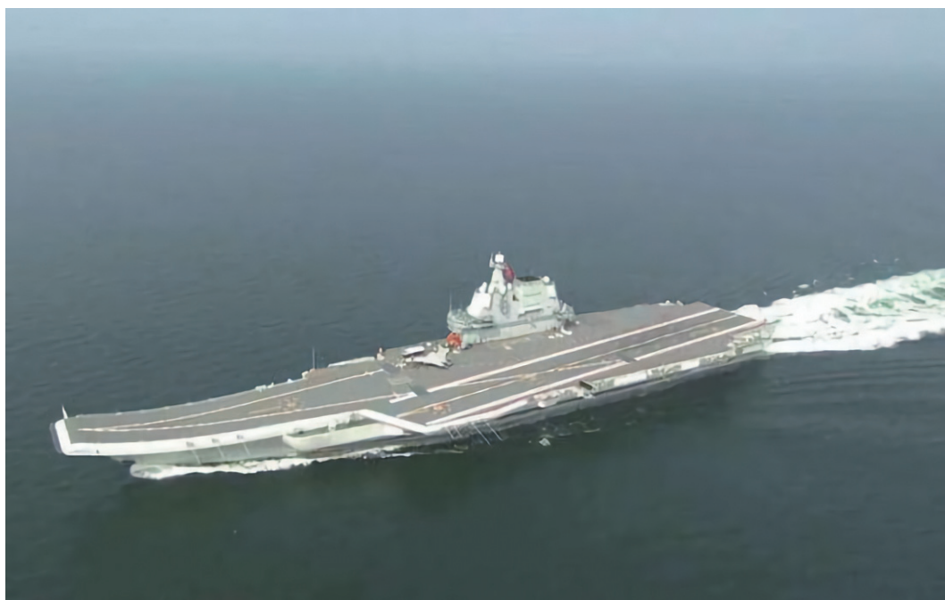
Figure 1. China's First Domestic Aircraft Carrier Is Sailing for a Test

Second, China's economic development can accumulate national power, which further empowers China's defense capability. Chinese assert that, to respond to external military threats, one needs sufficient budget to guarantee the development of advanced weapons, and sufficient budget comes from sufficient national power. The lesson that China has learned from the dissolution of the Soviet Union is that the Soviet Union was unable to find balance between its military and economic development. That is to say, the Soviet Union's economic growth was dragged down by its huge military expenditures. Besides, without sufficient national economic power, keeping the newly-developed weapons and equipment continuously updated will be impossible. Moreover, the troops need plenty of training, and military weapon operating and maintenance costs often are much higher than arms procurement costs.