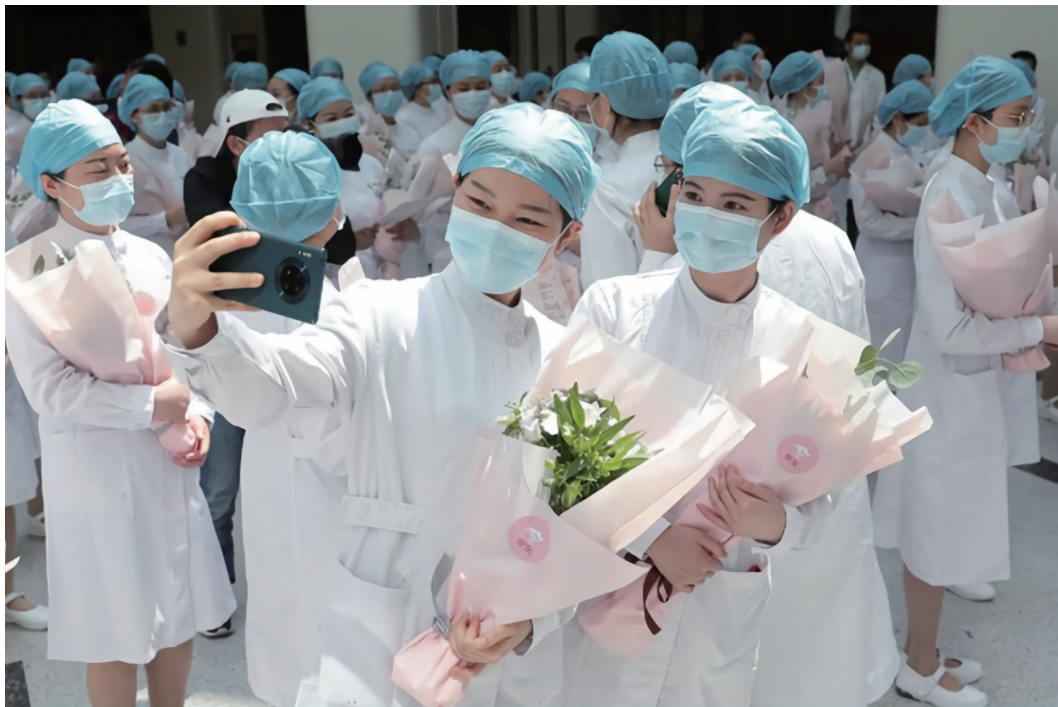
Figure 5. Nurses Wearing Face Masks Pose for Pictures During an Event Held to Mark International Nurses Day, at Wuhan Tongji Hospital

To leverage the COVID-19 pandemic to further strengthen the CCP's leadership is the CCP's fourth reason to make use of its propaganda. Through publicly honoring the medical personnel fighting against the coronavirus, the CCP wants to highlight its infallibility—only the CCP leadership can get it right and lead Chinese people out of such a crisis.