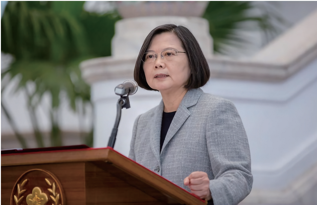
Figure 9. President Tsai Ing-wen States That Taiwan Is Actively Bolstering Epidemic Prevention Cooperation with the Other Countries around the World