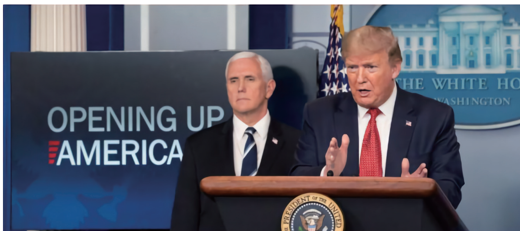
Figure 3. Trump and Pence

and allowed people in Wuhan to travel all over the world at the beginning of the epidemic. Regarding this, the conduct of the United States is the most indicative.