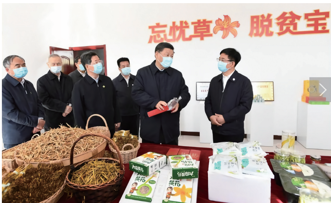
Figure 4. President Xi Jinping Learns About Poverty Alleviation Efforts in a Village of Xiping Township in Datong City

Source: An Baijie, "Xi: Poverty relief key to prosperity goal," China Daily , May 13, 2020, < http://www.chinadaily.com.cn/a/202005/13/WS5ebb3245a310a8b24115535e.html >.