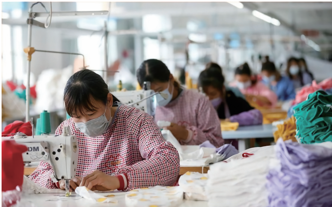
Figure 7. Affected by the COVID-19 Epidemic, Lots of Enterprises Producing Children's Wear Have Shifted from Exports to Domestic Sales through the Combination of Online Sales and Traditional Marketing Modes

Through propaganda, the Chinese government also tells Chinese people and the world that China has resumed its production. At the press conference of the Chinese State Council on March 6, 2020, Wang Jiangping, the vice minister of the Chinese Ministry of Industry and Information Technology, said that “except the Hubei province, in big industrial provinces, such as Zhejiang, Guangdong, Shandong, and Jiangsu, the rate of restarting the manufacturing production has surpassed 95%. The rate of small and medium enterprises to restart their production has reached 52% and is still increasing.” 3 The Chinese government fully understands that, the sooner people think the economic recovery has come, the sooner the economy can welcome its real recovery.