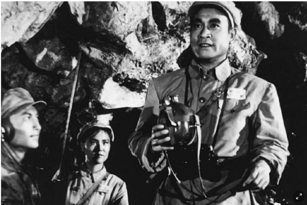
Figure 8. A Scene from the 1956 Chinese Film Shang Gan Ling, about the Korean War Battle for Triangle Hill

More resources must be devoted to promote the current Chinese economic and social status while the European and American economies and societies are yet to return to normality. Chinese people's self-pride will reach its peak since the Korean War in 1950. At the end of 1950, China suddenly deployed its troops to join the Korean War and coerced the United Nations Forces led by the United States into retreat from the Yalu River to the current border between North Korea and South Korea. This is China's biggest military achievement against Western countries since 1839, which has been promoted by Chinese for almost 70 years. We believe that they will not forget this history, especially when they have more tools of propaganda.